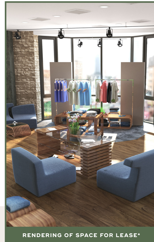
RENDERING OF SPACE FOR LEASE*

CURRENTLY UNDER CONSTRUCTION EST. COMPLETION: AUGUST 2023